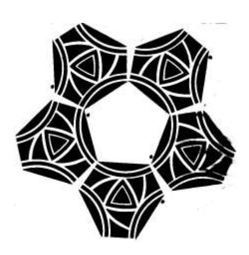
Advertised Before Acceptance Under Section 15(1) (Proviso).

132234. All types of Balls such as Foot Balls, Volley Balls, Hand Balls, Ball for Games (Small) Balls for Games, Playing Balls Games (Balls for) Games, and playing things and sporting articles not included in other Classes. M/S ALBERTA ENTERPRISES, Pakistani National Company, P.O. Box-982, Industrial Estate, Sialkot-4, Pakistan. Manufacturers, Merchants, Importers and Exporters, dated 5<sup>th</sup> October, 1995. Agent, Nadeem & Associates, 422-Sunny Plaza, Hasrat Mohani Road, Karachi.